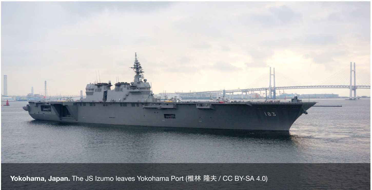
Yokohama, Japan. The JS Izumo leaves Yokohama Port

In Southeast Asia, Vietnam, the Philippines, and Malaysia have modernized and upgraded their maritime capabilities in response to increased Chinese presence in the disputed waters of the South China Sea. As China has engaged in land reclamation activities to build up small features in the area and erected infrastructure such as naval docks, landing strips, and radar and communications systems atop them, other claimant nations have come to feel that they too need increased naval capabilities to cope with Chinese assertiveness. Some of these efforts have been supported by Japan, which has donated used vessels and provided training to Southeast Asian countries as part of its defense capacity building program. 11 Other Southeast Asian countries are also active in the maritime domain. Singapore has steadily invested in defense procurement due to its persistent sense of vulnerability, with recent acquisitions including new submarines featuring more firepower and combat options. 12 Indonesia has also begun modernizing its naval forces in an effort to keep up with Singapore and Malaysia. 13 As a consequence of technological development and diffusion, the amount of interaction and tension on the high seas has intensified. The maritime order is increasingly a multipolar one, with many