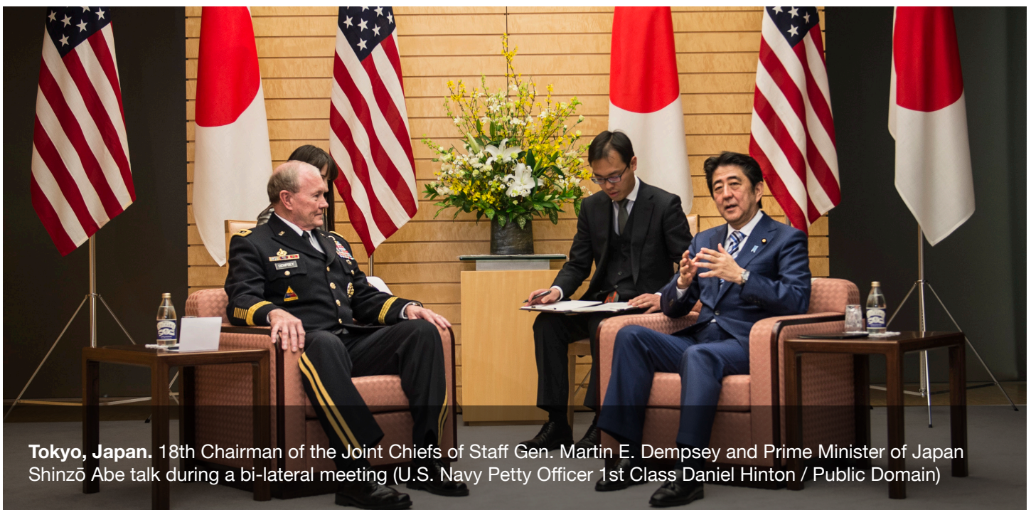
Tokyo, Japan. 18th Chairman of the Joint Chiefs of Staff Gen. Martin E. Dempsey and Prime Minister of Japan Shinzō Abe talk during a bi-lateral meeting

Although technology alone did not create these frictions between countries, many of which are rooted in long histories of complex interactions, the process of technological progress and diffusion has played an